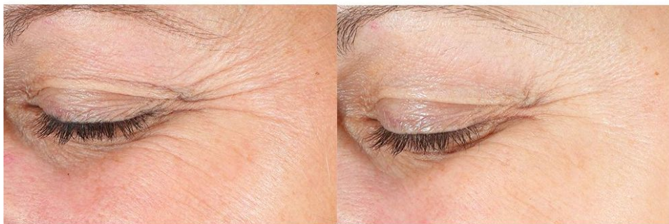
AFTER 12 WEEKS POST INJECTION