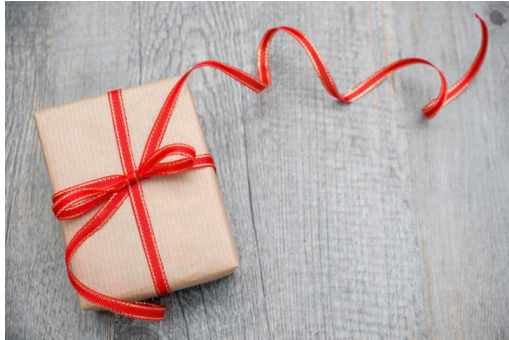
YOU, BEFORE NOV. 4

Open your holiday beauty, Saturday, November 4 ONLY!